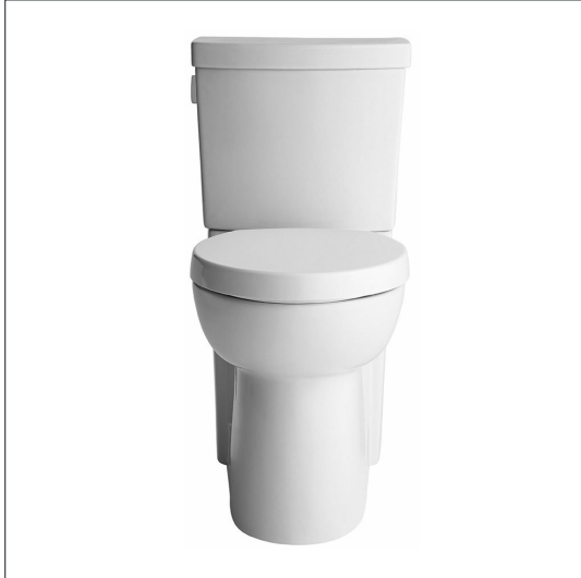
2794 119 Shown

STUDIO® ACTIVATE™ CONCEALED TRAPWAY RIGHT HEIGHT® ELONGATED TOILET WITH SEAT